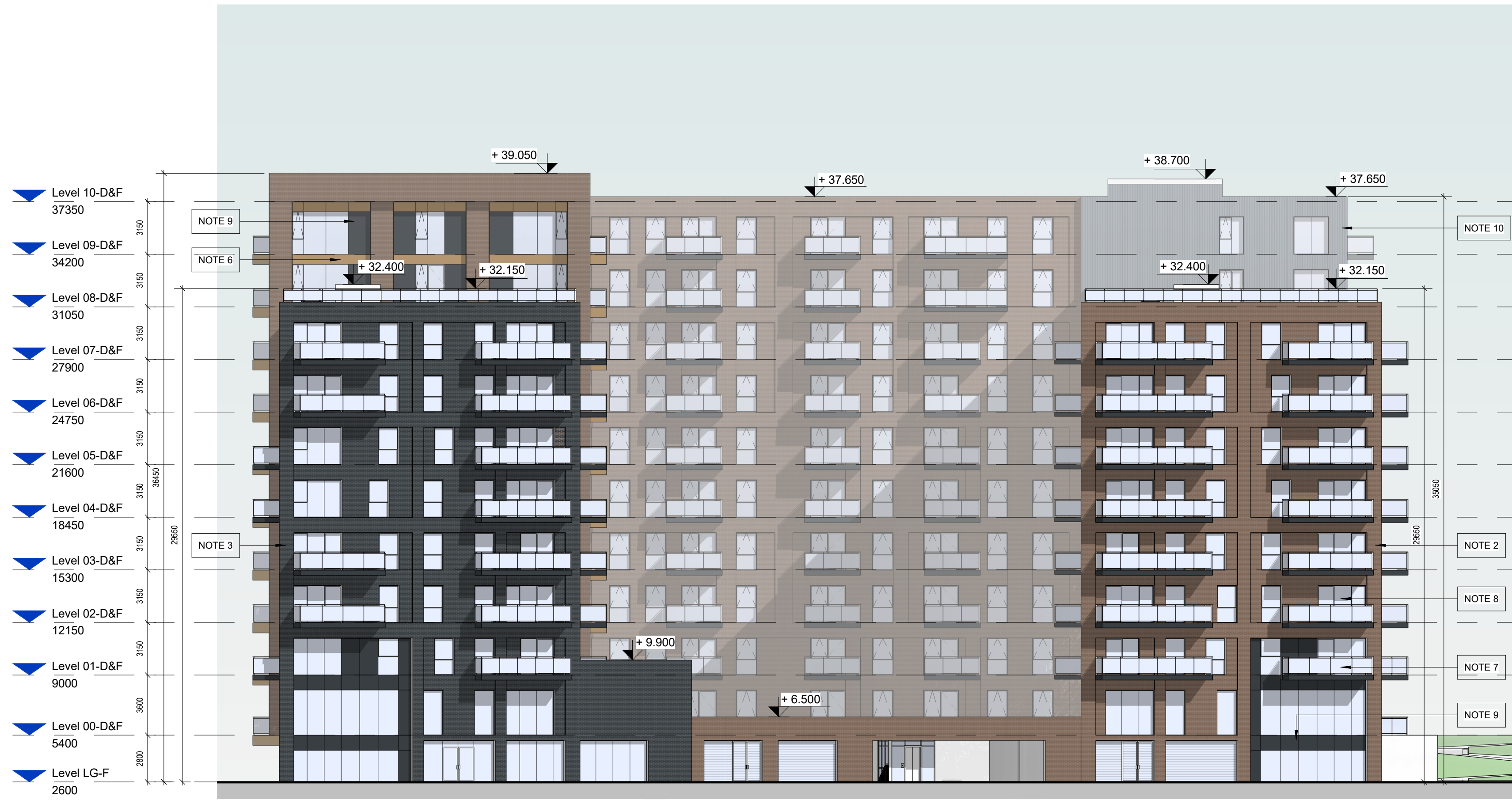
1 BLOCK F-SOUTH ELEVATION 1 : 200